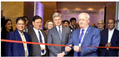
India Pulses and Grains Association (IPGA) successfully inaugurated the Sixth edition of The Pulses Conclave 2023, the World's largest event of the Pulses sector

agri-business and plays a more proactive role in the global domain to foster healthy relations among Indian market participants and between India and all associates overseas.