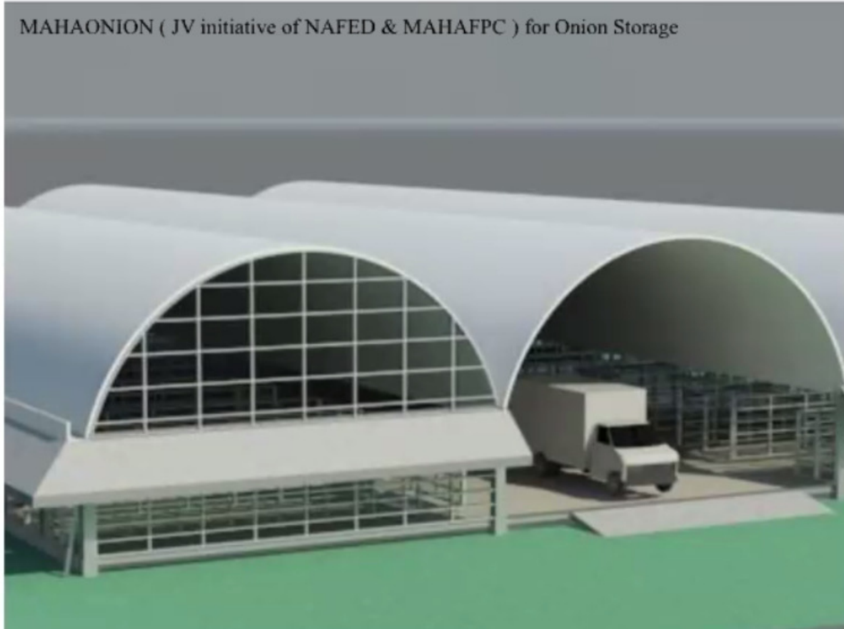
MAHAONION ( JV initiative of NAFED & MAHAFFPC ) for Onion Storage